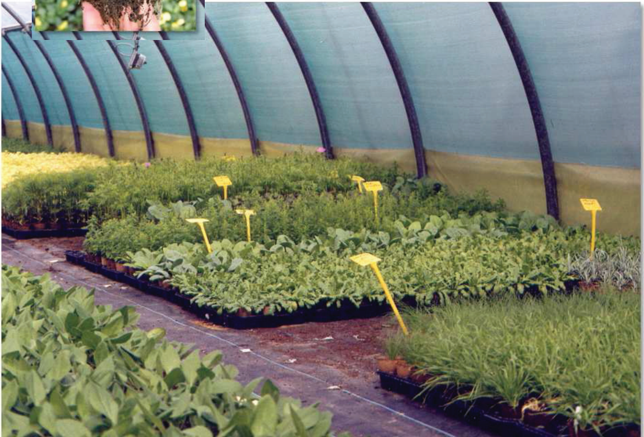
FERTILPOT for ornamentals

It also offers an original solution to the needs expressed by users looking for "ready to plant" products that will not be harmful to the environment.