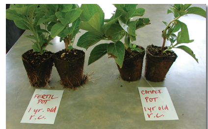
FERTILPOT root development VS Peat Pot

The speed at which it degrades depends on different parameters, primarily linked with the intensity of microbial activity. With spring planting in a temperate climate, only a few fragments of the wall will still be visible after a few months.