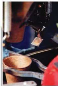
Automatic destacking with FERTILPOT

The FERTILPOT is easily biodegradable and transforms into organic matter.