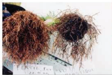
Comparison root development

The volume of the pot is used 100% by a dense network of root hairs. In containers with impermeable walls, a few very long roots use all the area around the pot. This difference in quality of the root system is the main explanation for the marked difference in development between two identical plants grown in a FERTILPOT and a plastic pot, using the same pot size.